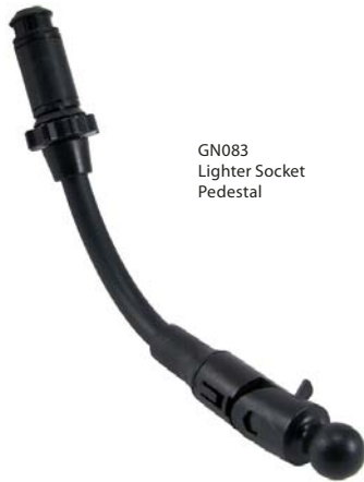
GN083 Lighter Socket Pedestal